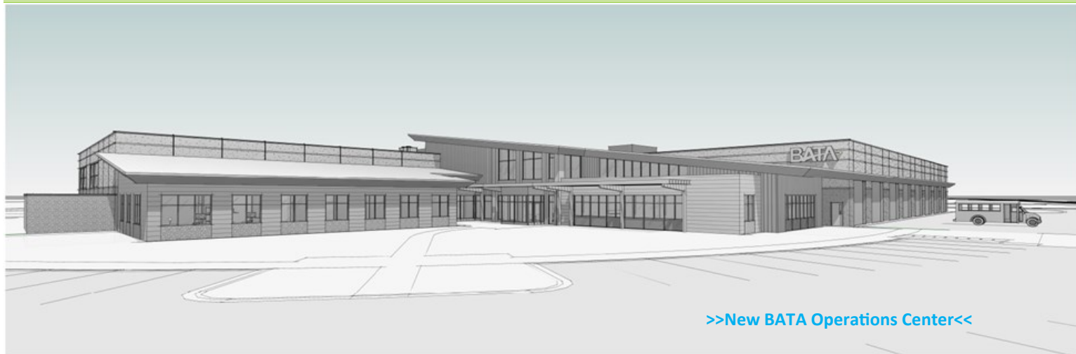
>>New BATA Operations Center<<